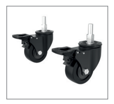
Castors with locking brakes

The complete solutions can be combined and extended with the components of the comPROnents® series without restriction and thus offer further application possibilities.