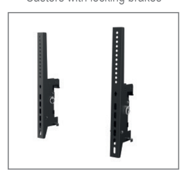
VESA-Arms, 0 - 20° tiltable